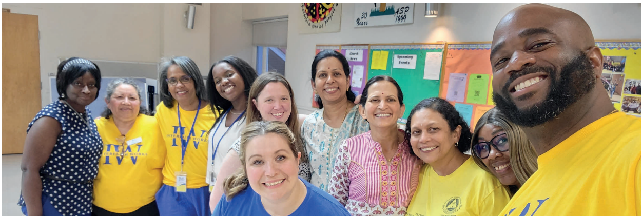
The IW team enjoyed yoga and other wellness and self-care activities.

To meet our staff's needs and concerns, we created a Diversity, Equity and Inclusion committee, which included establishment of a Safe Space Ambassador team. These ambassadors serve as contact points for staff who are seeking support and understanding when facing challenges or conflicts. We also created a Trauma-Informed Care subcommittee, which meets regularly to train and support staff. The training covers what trauma is, how it manifests in our clients, how it manifests in ourselves, and ways to counter it reactively and proactively. This is crucial in workplace environments that often are high-stress.