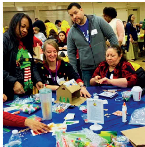
Our holiday celebration included dancing, music, and crafts.