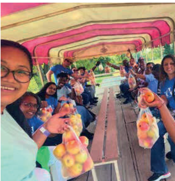
IW staff had a fun day of apple-picking and teambuilding at Butler's Orchard.