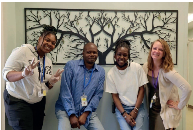
Staff of New Leaf Shelter

"I was so surprised by the Panes con Pollo! I just wanted to thank you. I even told my mom about them and she says you all are angels."